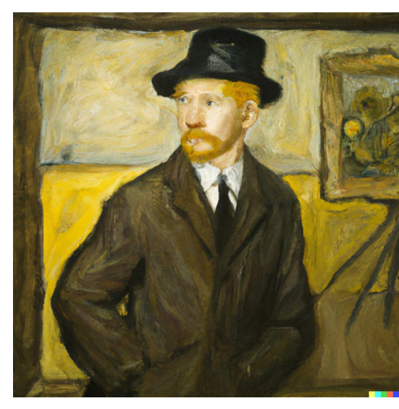
Figure 3 created using Dall-E by OpenAI by inputting "The Investor by Vincent Van Gogh"

Now, it is important to understand that there are differing levels of information in the marketplace based primarily on the size of the company and the type of