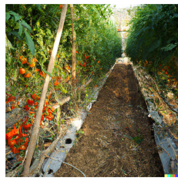
Figure 2 created using Dall-E via OpenAl

Asset-backed lending (meaning having collateral to cover the loan if the business fails or doesn't make payments) would be the desired approach for the Tomato Farm, as it will significantly lower their cost of capital. If the Tomato Farm needs more funding then the aforementioned $20 million, they will need to analyze whether equity or debt is cheaper. Any further funding would be subordinate to the asset backed debt already in place. The Tomato Farm and potential investors would need to assess expected annual