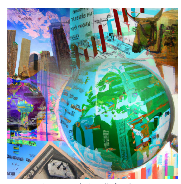
Figure 1 created using Dall-E from OpenAl

Meanwhile, Wall Street tries to cater to companies and investors alike while considering their own goals. They do this by continuously creating products offered to both parties, and who in turn are ultimately responsible for understanding both investment and structure, as well as all the complexities that come with them. This is true of generally "good" investment innovations (for example, ETFs